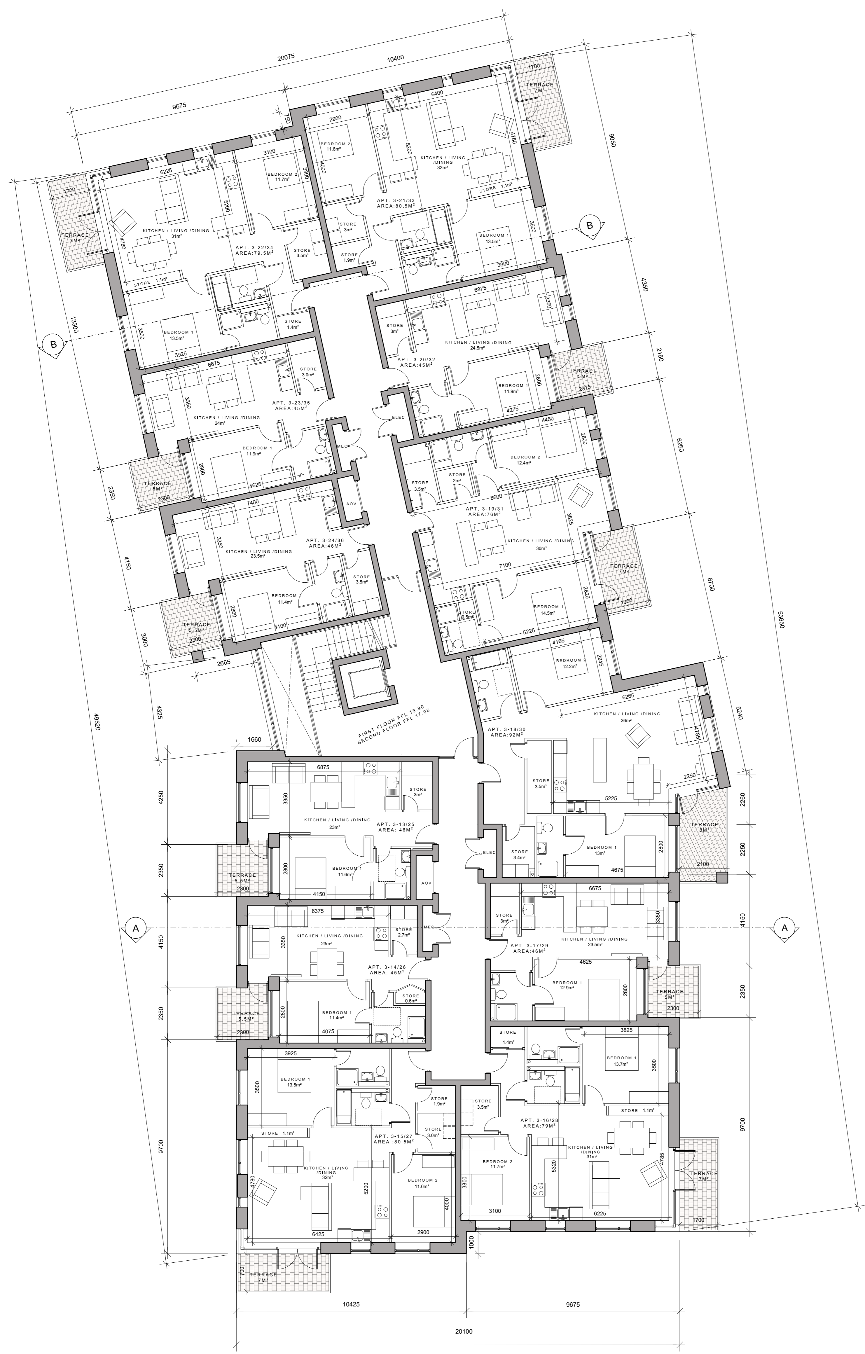
BLOCK 3 FIRST / SECOND FLOOR PLAN SCALE: 1:100